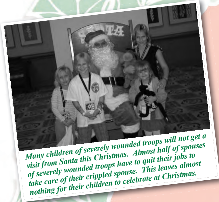
Many children of severely wounded troops will not get a visit from Santa this Christmas. Almost half of spouses of severely wounded troops have to quit their jobs to take care of their crippled spouse. This leaves almost nothing for their children to celebrate at Christmas.