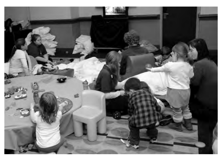
Many children of our disabled troops have also suffered as a result of their parents' injuries in Afghanistan or Iraq. While attending the Road to Recovery Conference they got the chance to see Walt Disney World, and their parents got the chance to spend some care-free time with their families.