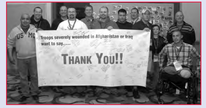
Severely wounded troops and their families express thanks to Coalition supporters who made the event possible.

One hundred severely wounded troops plus their families heard inspirational speeches, explored job opportunities, made new friendships and even got a surprise $500 Christmas gift check the Coalition's Sixth