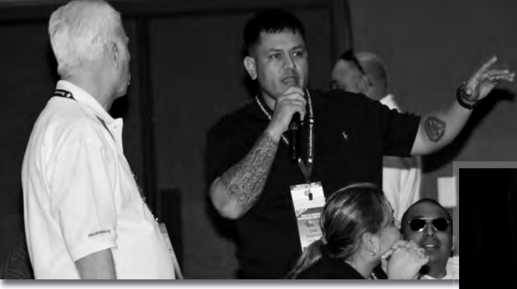
▲ Motivational speakers and question-and-answer sessions lifted the spirits and broadened the knowledge of severely wounded troops and their families.

Panel discussions led by severely wounded troops gave attendees the chance to relate their own stories and realize they are not alone in having troubles along the Road to Recovery.