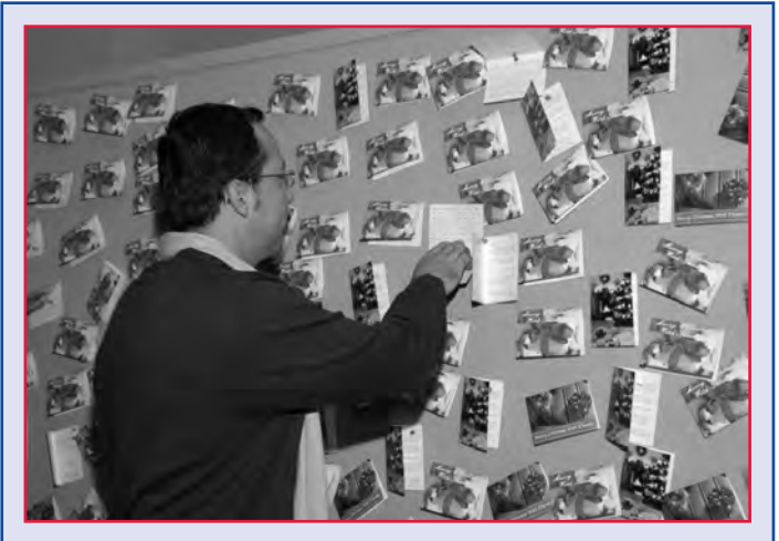
Coalition supporters have sent hundreds of thousands of THANK YOU and GET WELL cards to severely wounded servicemen and women all across the nation. Here an attendee at the December Road to Recovery Conference in Orlando looks at a fraction of the cards the Coalition receives.

The greeting cards tacked to the bulletin boards were a sampling of the same ones that had been signed and mailed back by the estimated 600,000 Americans who have