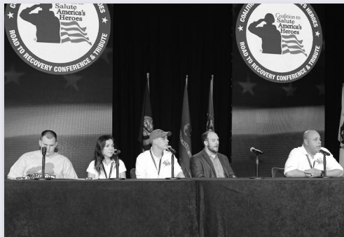
◀ A panel of Coalition spokespersons — all wounded veterans themselves — answer questions and offer practical advice to severely wounded troops struggling to get medical help, pay the bills, or readjust to civilian life.

★ ★ ★ ★ ★ "Your generosity is changing our life. Thank you for caring about us!" ★ ★ ★ ★ ★