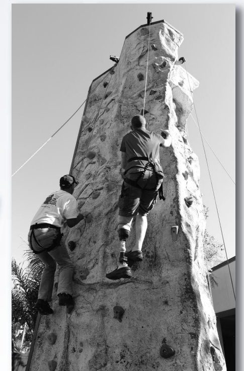
▲ True grit: Despite their injuries, many determined heroes scaled a 30-foot wall at the Sports Expo.