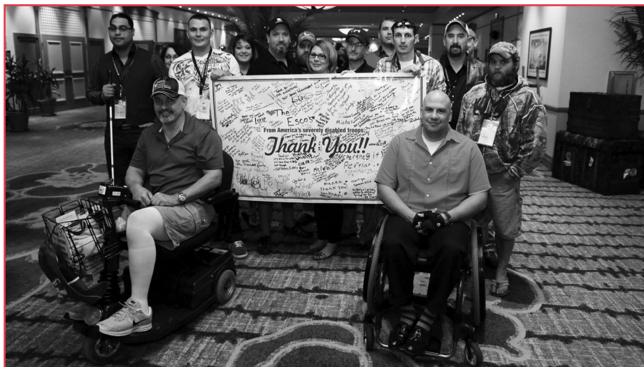
Severely disabled troops and their families signed this huge "Thank You" banner to express their gratitude to Coalition supporters for sponsoring the 2013 Road to Recovery Conference, which was held in Orlando, Florida from December 9 to December 13.