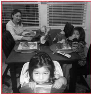
The wife and daughters of a wounded hero enjoy Thanksgiving dinner as a result of the $60 they received from faithful Coalition supporters. Can you help feed another desperate military family this Easter?

"I've been struggling so hard since I got out. I was homeless for a while."