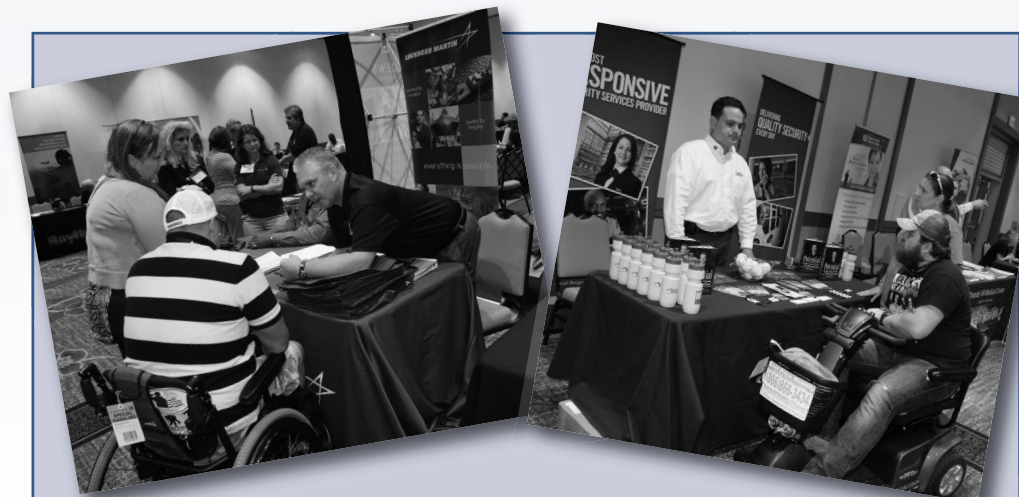
At the conference's Career Fair, disabled troops got the chance to discuss job opportunities with representatives from Lockheed Martin and many other major employers.

Nearly 100 more severely disabled troops have embarked on their own Road to Recovery, thanks to the Coalition's generous supporters. Remarked one wounded hero, whose life had been turned upside down by his injuries, "Thank you for a little while of normal!"