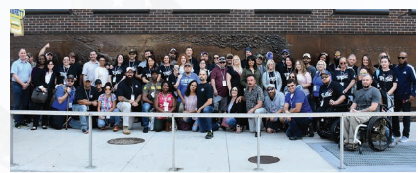
These photos were taken at last year's Heroes Freedom Weekend event in New York City. Look for photos from our 2019 event in a future newsletter!